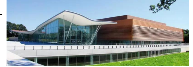
The Vendespace, where the competition takes place

7 km between downtown La Roche sur Yon and the Vendespace